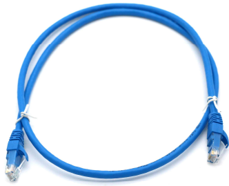
eLan Category 6 UTP patch cord blue RJ45, 1m