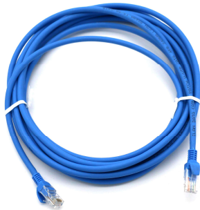
eLan Category 6 UTP patch cord blue RJ45, 5m