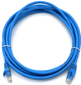
eLan Category 6 UTP patch cord blue RJ45, 3m